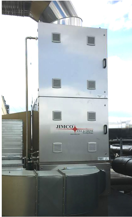
FLO-P with two doors 100 pcs. UV-C Lamps 81W or 165 W-HO lamps