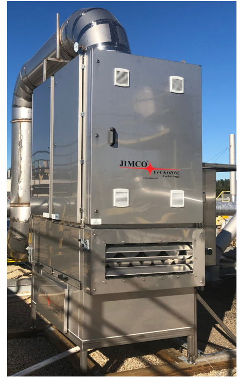
FLO-P with one door 60 pcs. UV-C Lamps 81W or 165 W-HO lamps