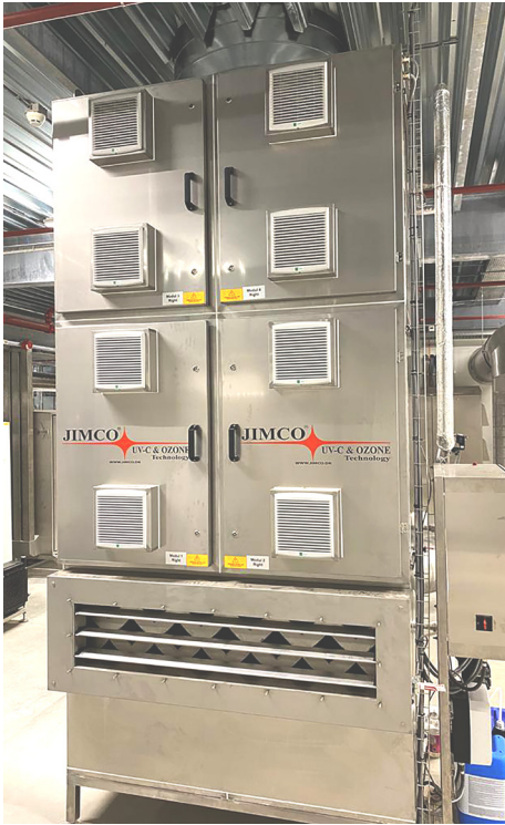
FLO-P with four doors 150 pcs. UV-C Lamps 81W or 165 W-HO lamps

Professional and environmentally friendly air purification of process air and odor control